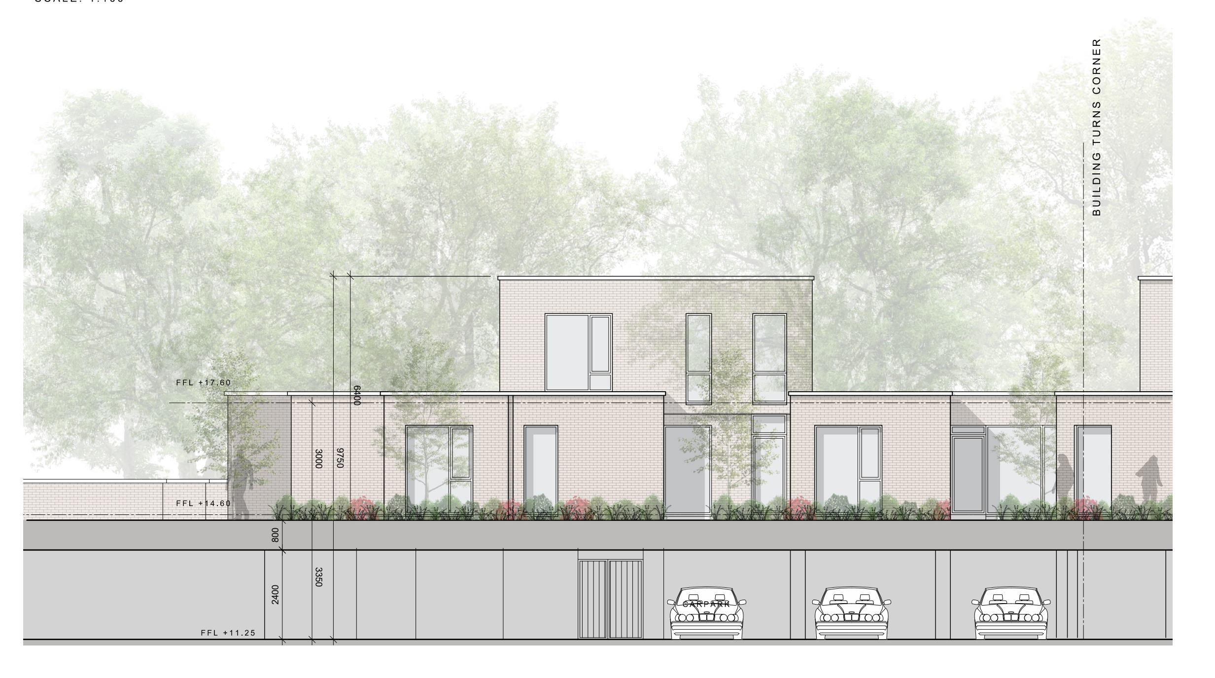
DUPLEX APARTMENT BLOCK 2D: NORTH WEST FACING ELEVATION SCALE: 1:100 EXISTING MATURE PLANTING BEYOND TO DUBLIN ROAD SHOWN INDICATIVELY (SEE ARBORIST'S REPORT FOR DETAILS)